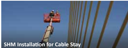
SHM Installation for Cable Stay

Before the development of wireless communication and PCs, MISTRAS engineers were hard at work, developing a company that specializes in signal processing monitoring systems. As MISTRAS monitoring systems began to develop and wireless became more prevalent, organizations like FHWA, began contacting MISTRAS to design wireless SHM systems. In the following years, more bridges and structures required MISTRAS' systems to properly and effectively monitor cables for defects and flaws. In 2000, the Delaware River Port Authority requested a system to monitor wire breaks in suspension cables; in 2007, MISTRAS delivered the 3rd generation system to FHWA; and in 2011, the 4th SHM system was introduced. As technology changes and the industry grows, MISTRAS plans to introduce future innovations in order to further reduce installation time and costs.