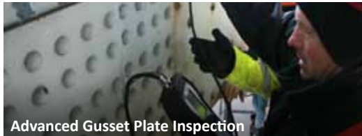
Advanced Gusset Plate Inspection