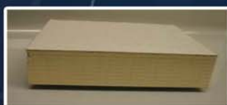
Metal skins, foam core