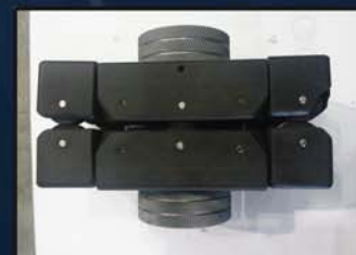
Magnetic wheeled carriers