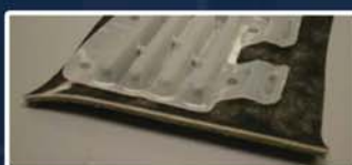
Plastic to foam welds