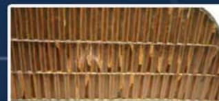
Multiple core sheets