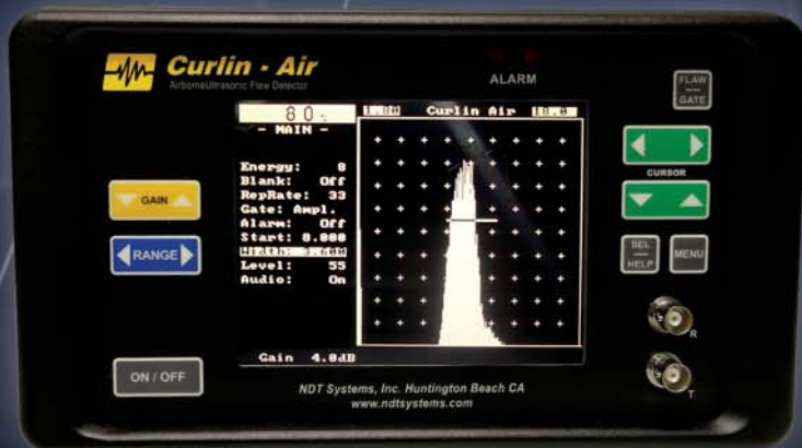
Curlin Air- Inspection of composites using air-coupled ultrasonics