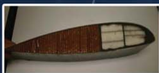
Carbon fiber skins, honeycomb core

Marine composites application with multiple core sheets and glue lines between- inspecting for skin to core and core to core disbonds.