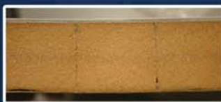
Glass fiber skins, wood core