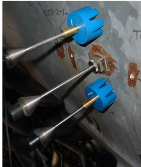
Sensors detecting cracking while overcoming high background noise of the operating turbine.

Acoustic Emission, when employed with multiple sensors, is capable of not only