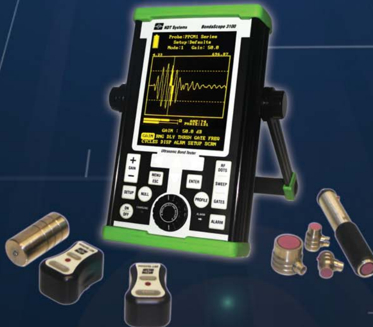
BondaScope 3100- Multimode bond tester for checking the integrity of bondlines